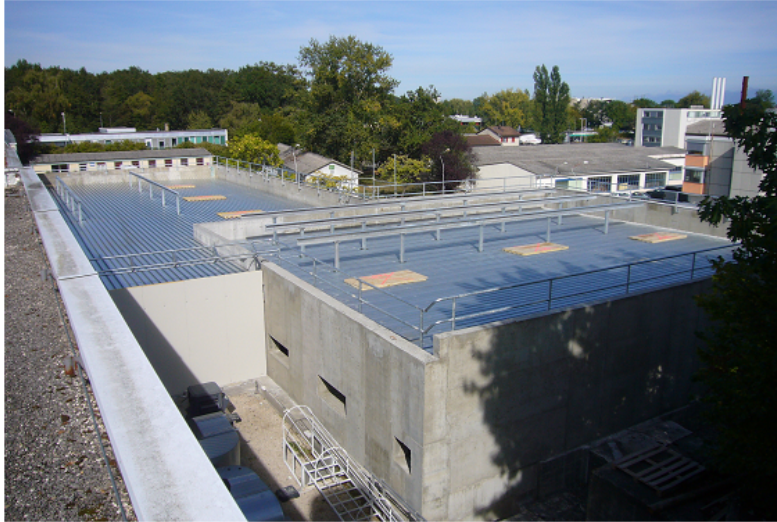
Top-view construction side: 20 September